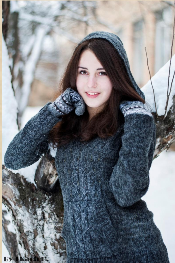
By Tkach B.